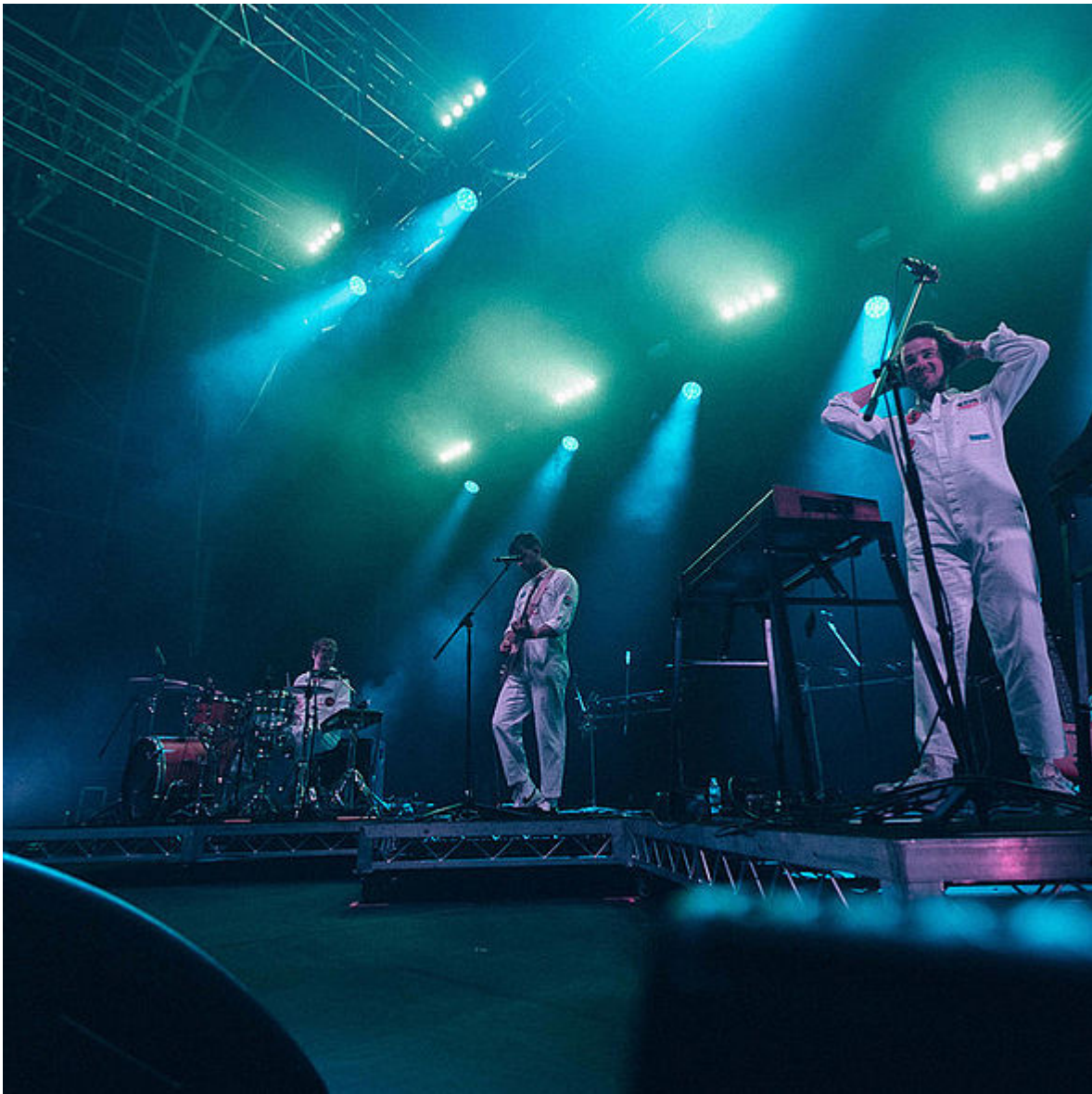
Stage Venue Events