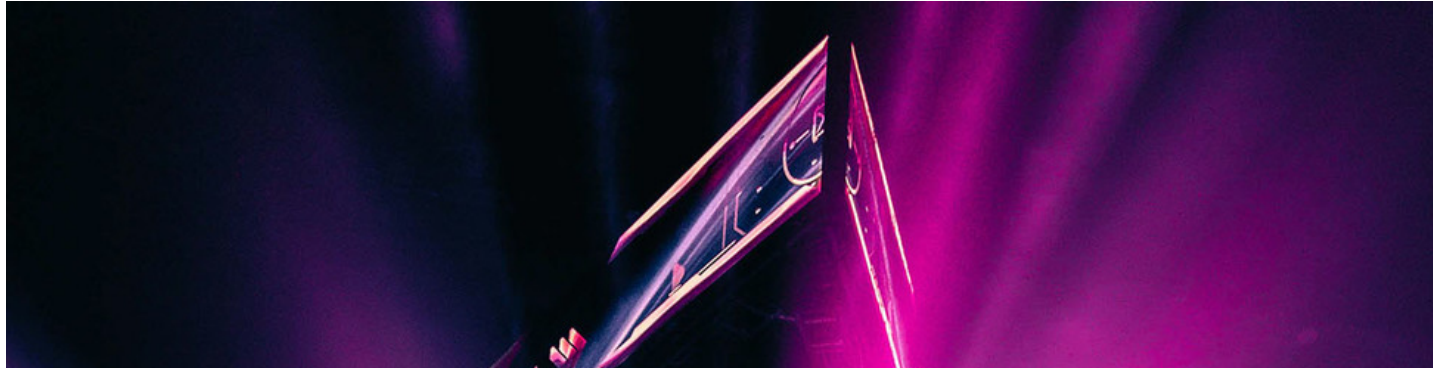
Valmar Plays Hard with Robe at Budapest Arena