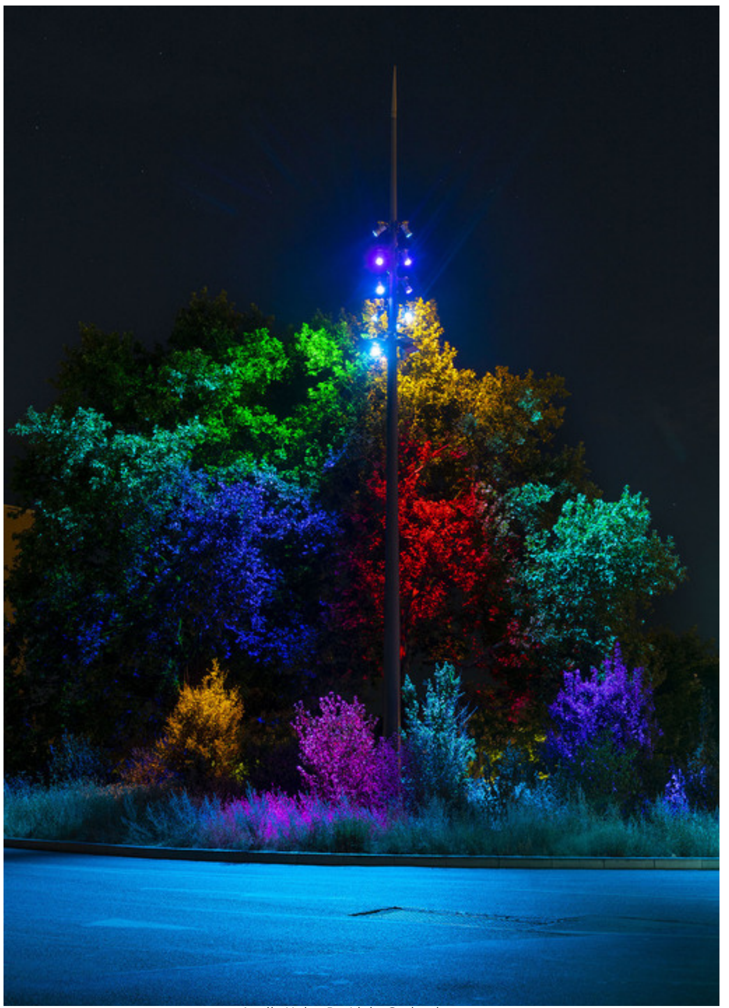
Anolis Helps Re-Light Gerland Park in Lyon