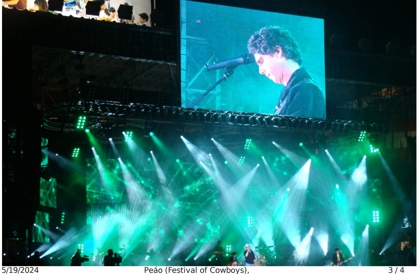
Peáo (Festival of Cowboys),