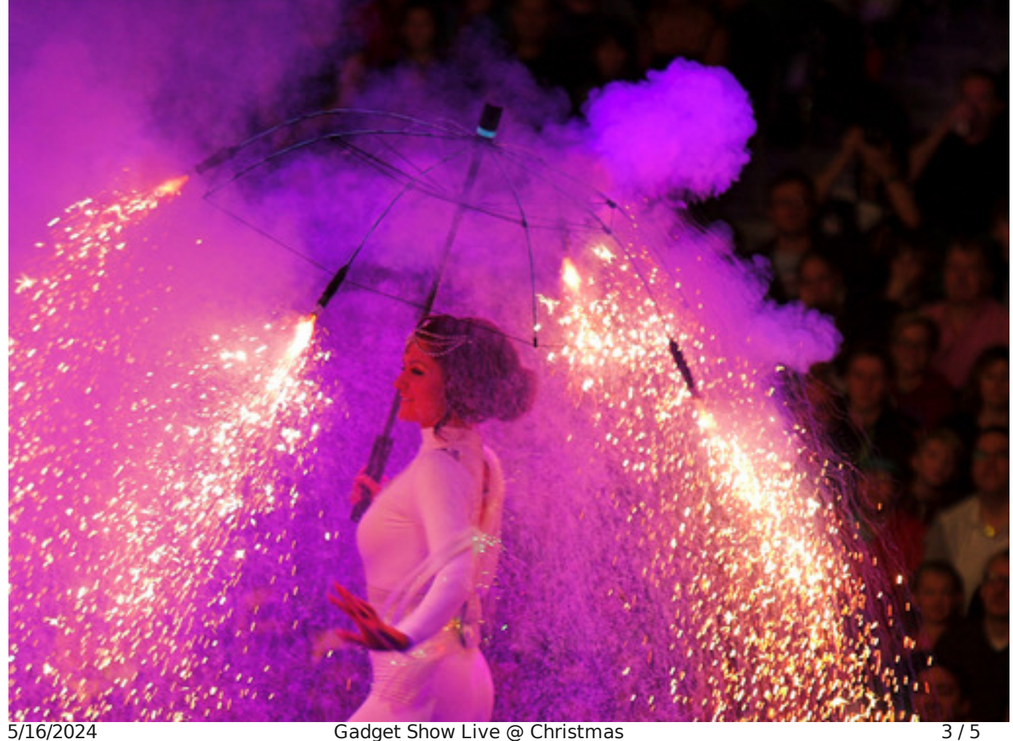
Gadget Show Live @ Christmas