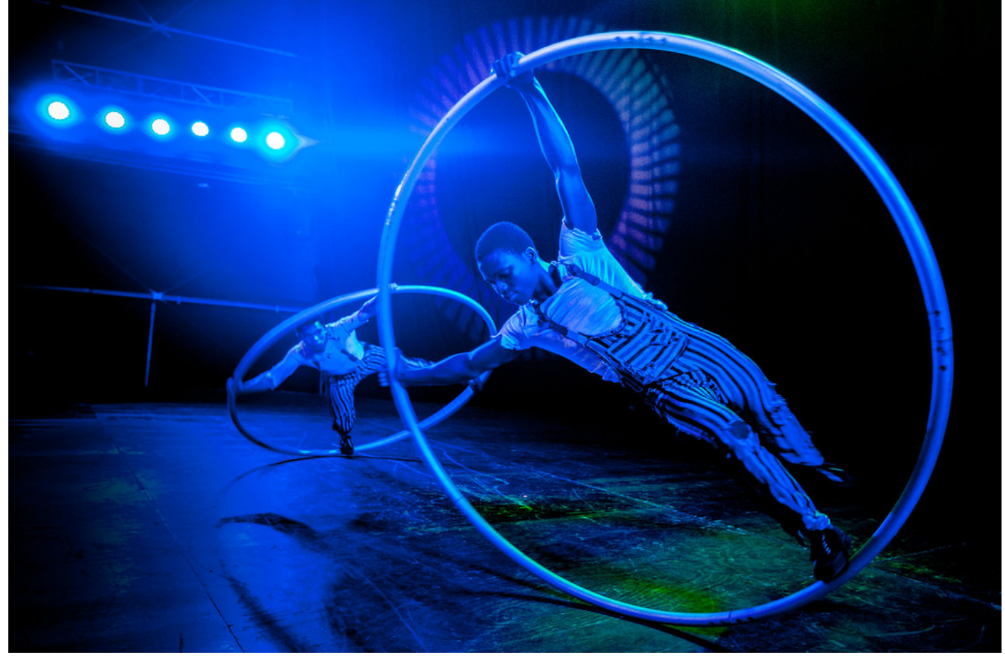
Robe Flies High With Zip Zap Circus School