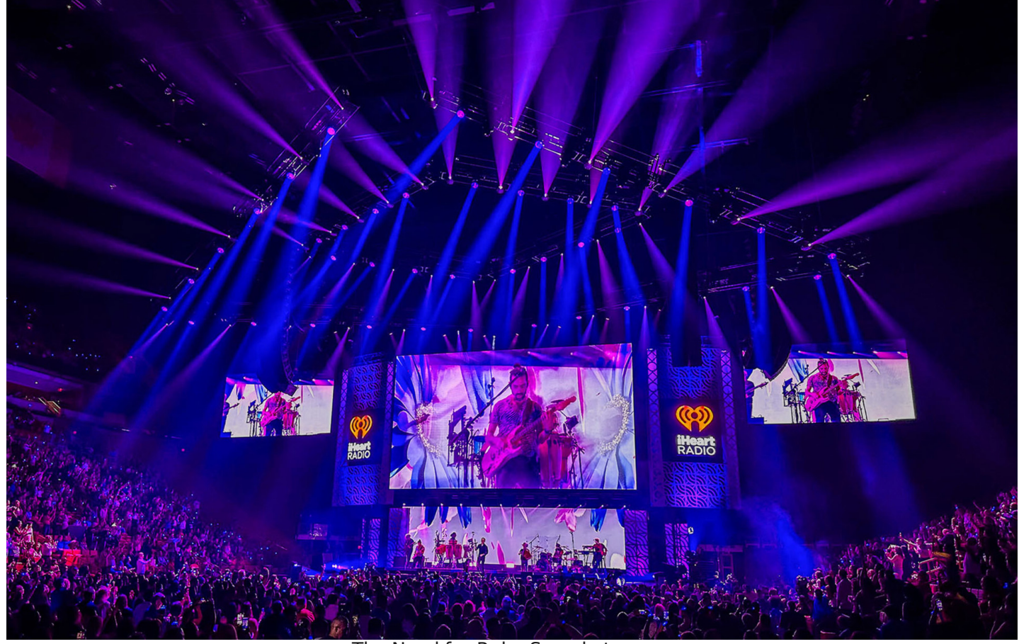
The Need for Robe Speed at iHeartRadio Fiesta Latina