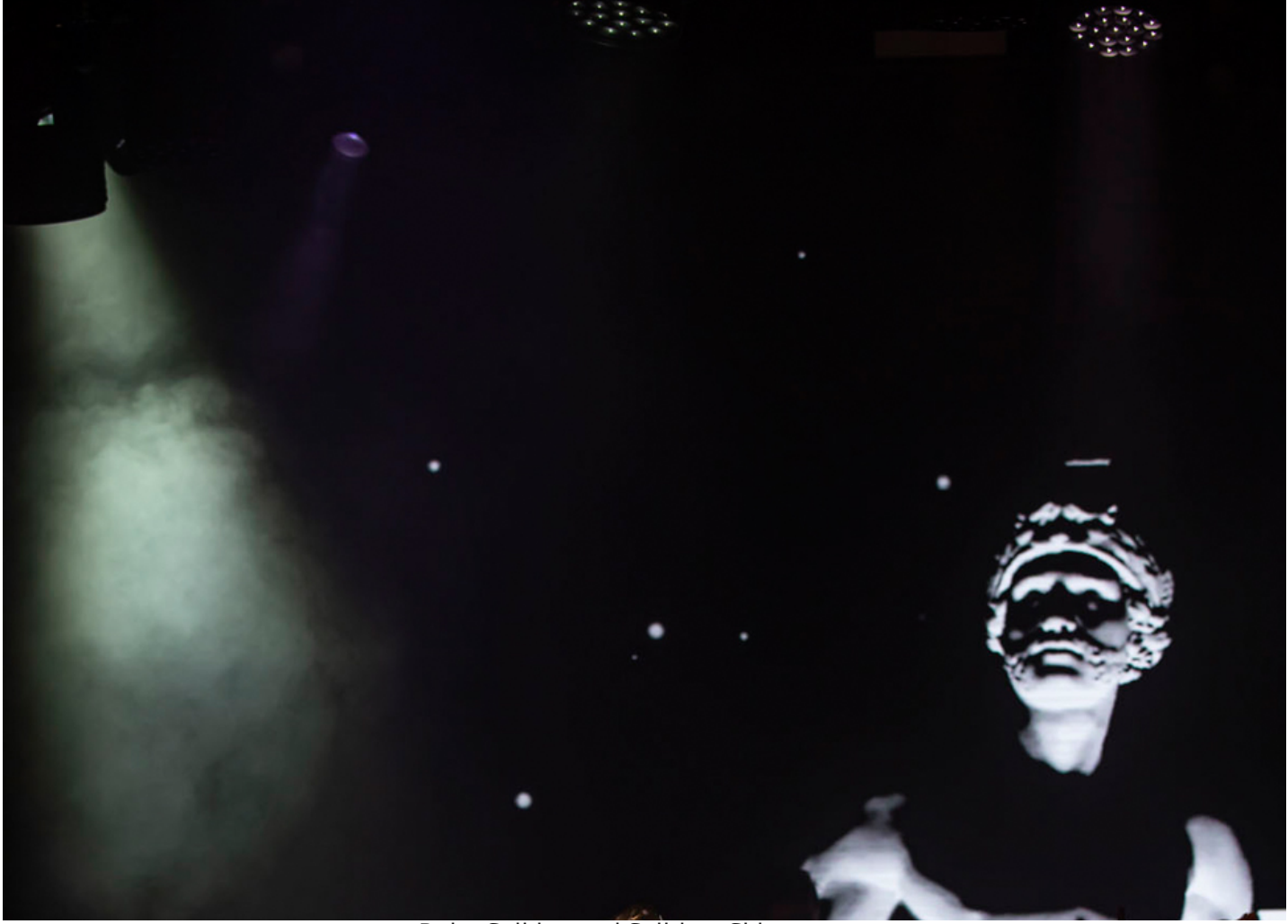
Robe Spikies and Spiiders Shine through the Myst